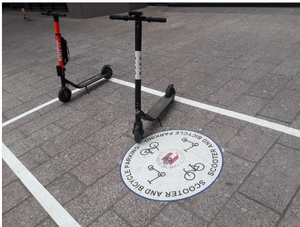
Image 3. The city has designated spaces to park scooters.